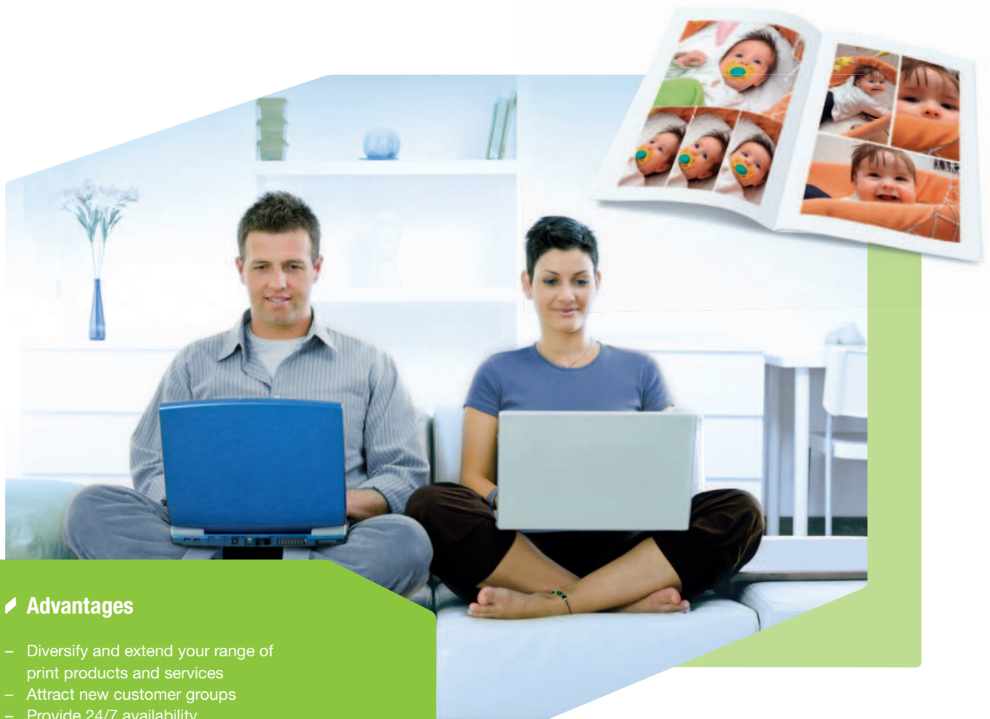
Photo book creation is an easy and attractive enhancement of your online print offering. Via a photo book application, you provide your customers with easy yet extensive online layout possibilities to create albums or calendars with their photos of holidays, events and other occasions. Similar to other web-to-print applications, photo book software includes online submission, payment and tracking, right down to the final delivery or collection of the printed photo book.

“Expand your services and grow your revenue.”