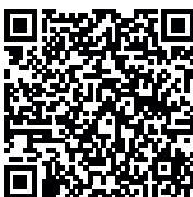
Visit our product page