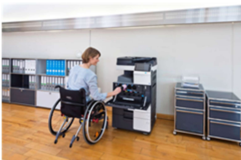
Thanks to the front access to the device, toner can be easily changed.