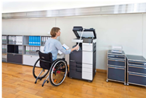
An assist handle enables the document feeder to be lifted easily.