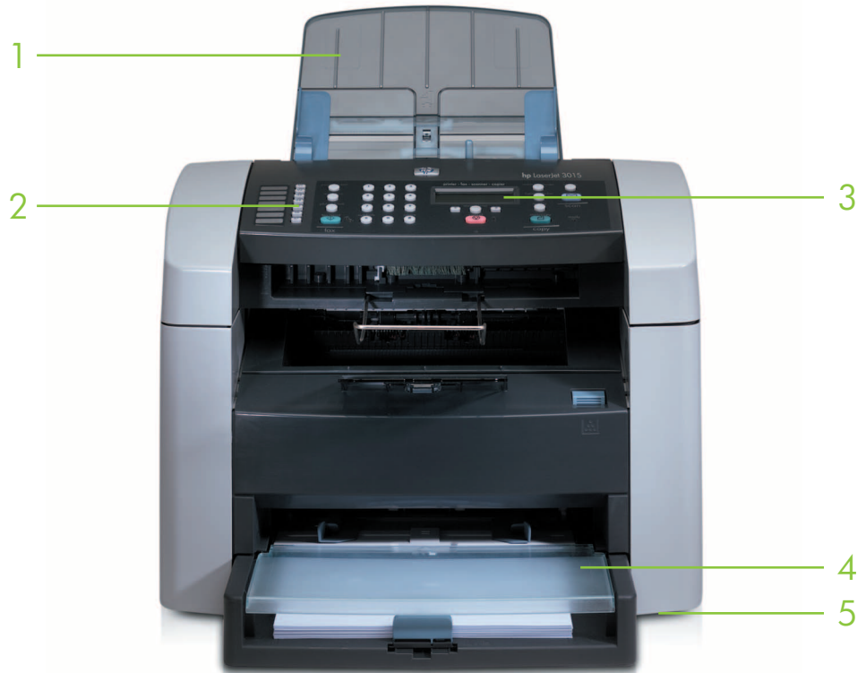
HP LaserJet 3015 All-in-One front shown

120-speed dials and 110 group dials for handy faxing