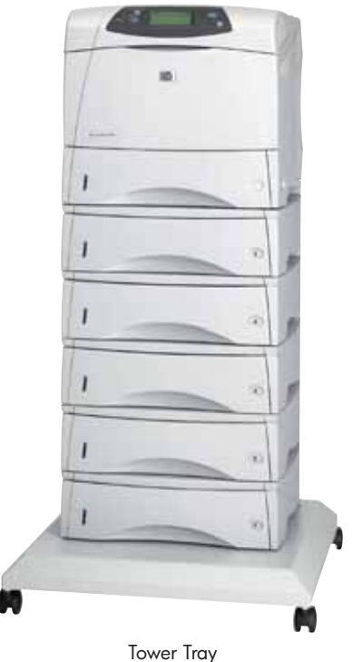
Adds up to 4100 sheets (8 x 500-sheet paper tray + 1 x 100-sheet multipurpose tray). For more information go to: www.hp.com/eur/gsc