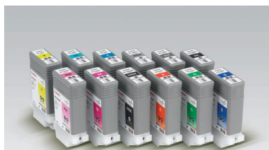
12-color inks for ultra-high-quality imaging