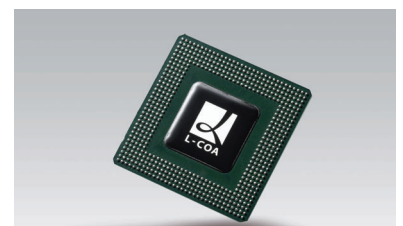
L-COA Image Processor