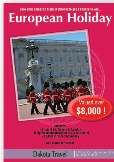
Created in PosterArtist