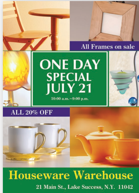
Created in PosterArtist

Download a trial version today. For more information, please go to usa.canon.com/posterartist .