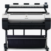
iPF770 MFP L36