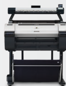
iPF670 MFP L24