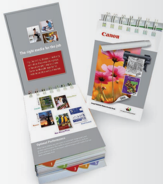
imagePROGRAF Media Swatch Book

For more information on Canon Media, please visit the Canon Consumables Web site at usa.canon.com/consumables/media .